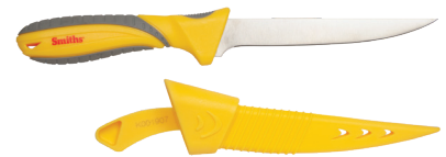
Mr. Crappie Slab Daddy 6" fillet knife